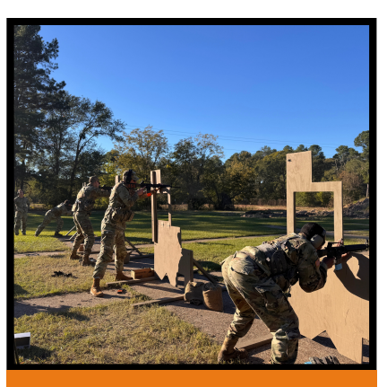
MS3s counducting Table VI qualifications.

On November 15, the Bearkat Battalion had the privilege of participating in HPD Range Day, an essential training event focused on sharpening marksmanship and weapon-handling skills. This opportunity was particularly significant for our MS3 Cadets as they prepare for Advanced Camp this summer, a critical milestone in their ROTC journey.