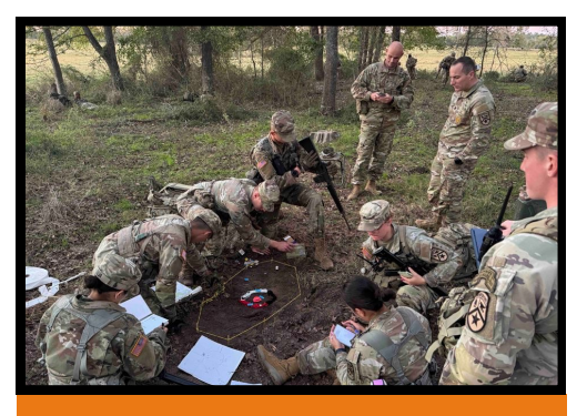
MS3s' discussing their terrain model for the Defense lane.