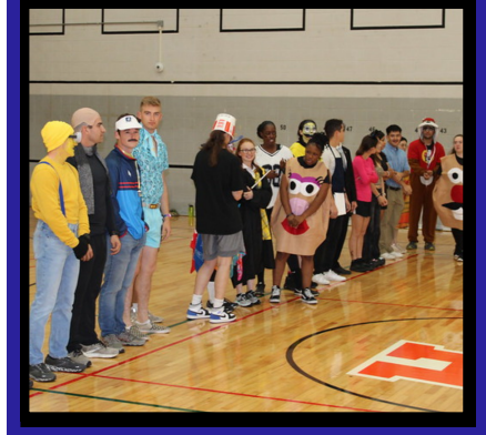
Check out what our cadets dressed up as for Halloween PT!

It's been a month of service, achievement, and community. We look forward to continuing this momentum into the months ahead!