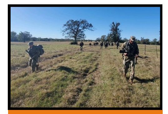
Cadets tactically marching to their first lane.

Cadet Tanner Stone Bearkat Battalion Cadet S3